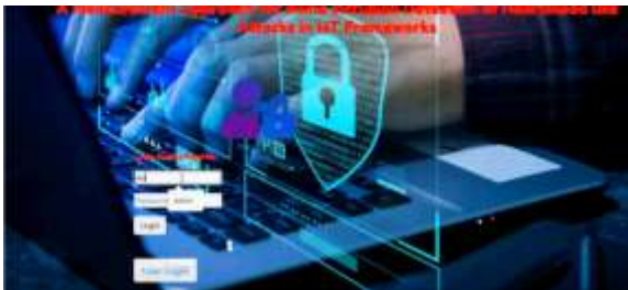
A Measurement Approach for Inline Intrusion Detection of Heartbleed like Attacks in IoT Frameworks