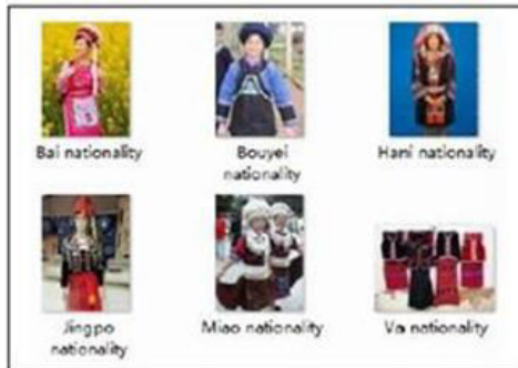
Figure 1. An example of the minority costume image dataset.

for e-commerce apparel. The paper compares a variety of color feature extraction methods and similarity measure methods. Experiments show that Euclidean metric and global color histogram using RGB space are relatively appropriate for clothing image search. In general, all above algorithms are designed to describe the feature of ordinary clothing image from perspective of color, shape, and texture.