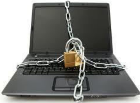
Diagram clearly explain the about the secure computing

phrase that gives a user access to a particular program or system.