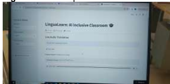
Fig. 2: Real-time Student Output in Telugu.