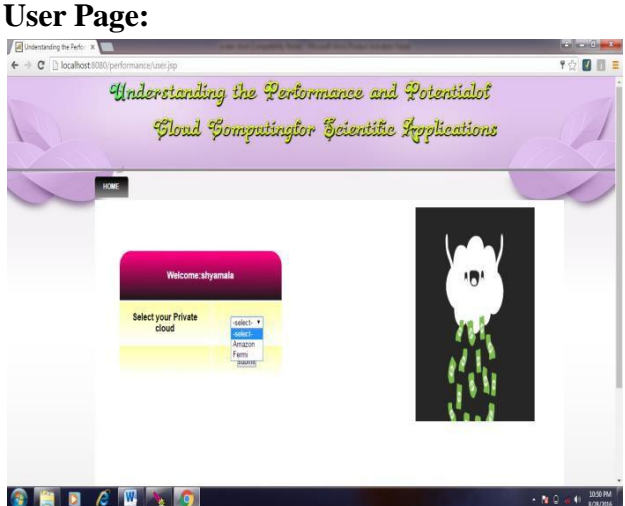
Fig 6.4: User Page Amazon Cloud Login Page: