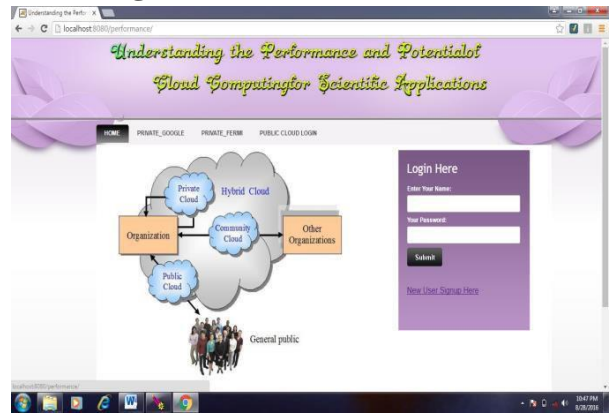
Fig 6.1: Home Page Cloud User Register Page: