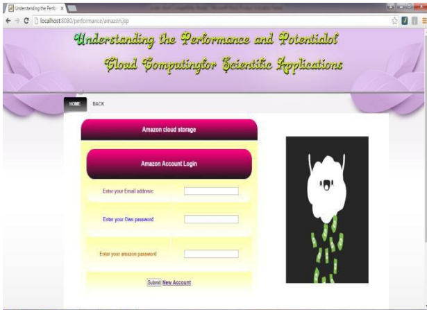
Fig 6.5: Amazon Cloud Login Page Success Page: